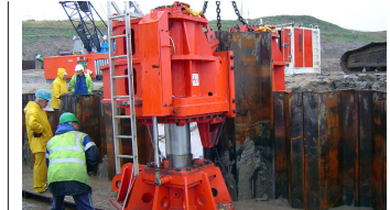
Specialist Work >